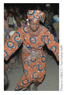
• The Oral Heritage of Gelede, Benin, Nigeria and Togo

There is also a huge variation in the amount of documentation and the degree of detail provided in inventories. It seems not physically or financially feasible to provide detailed information about all the intangible cultural heritage manifestations present in countries with a tremendous variety of intangible cultural heritage. About half of the systems in use today present extensive documentation, while others are less exhaustive in providing information about listed elements. Some take the form of catalogues or registers, while others present information as a series of encyclopaedia-like entries. In Brazil, a system is used that incorporates both approaches. There is a national level of elements that have been included in a 'Registry' and another level with elements included in an 'Inventory'. On a national level, extensive documentation is