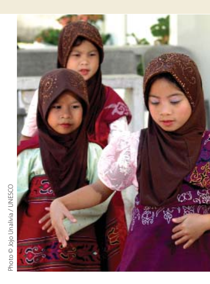
The Darangen Epic of the Maranao People of Lake Lanao, Philippines

detail, and the mechanisms of conducting, maintaining and updating those inventories will be determined by each State, 'in a manner geared to its own situation'.