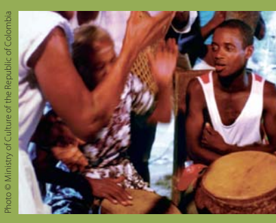
✿ The Cultural Space of Palenque de San Basilio, Colombia