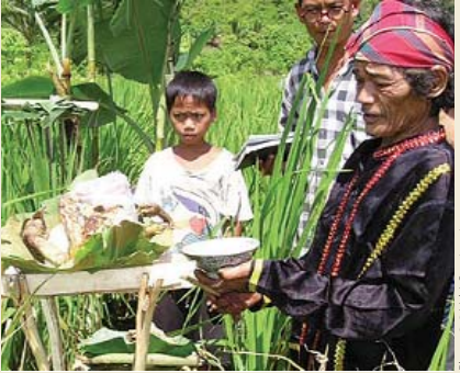
• A Subanen performing ritual before entering new documentation site as a way of asking permission from the unseen and informing them that specimen collection is to be carried out for documentation

This 'self-documentation' has turned out to be a successful way to preserve orally transmitted botanical knowledge and to make it available for present and future generations, contributing to the viability of this part of the Subanen's intangible cultural heritage.