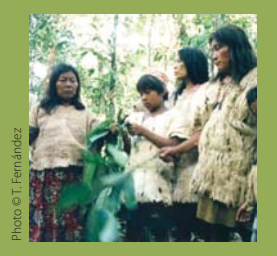
• The Oral Heritage and Cultural Manifestations of the Zápara People, Ecuador and Peru