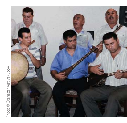
Shashmaqom Music, Tajikistan and Uzbekistan

Another major difference between States is that some limit themselves to inventorying indigenous or native intangible cultural heritage while others – Belgium and the USA, for instance – also take into account the intangible cultural