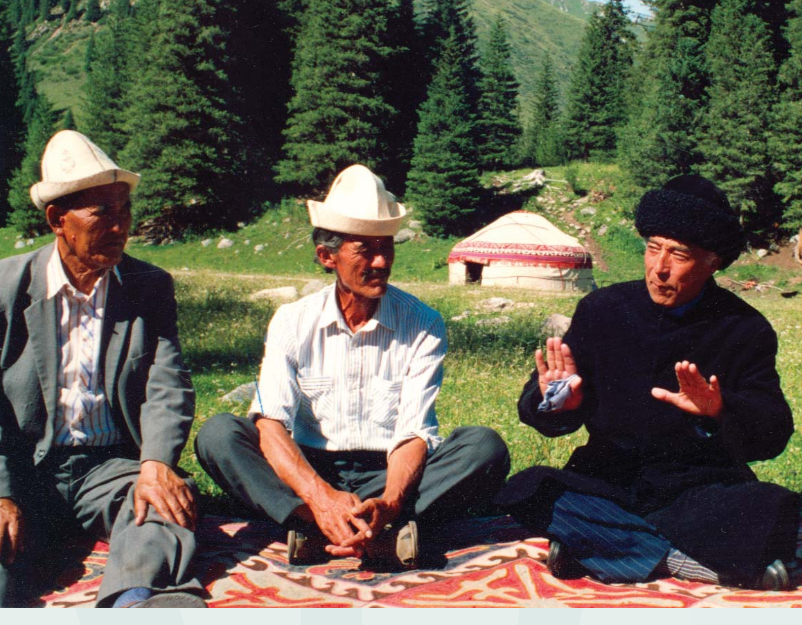
• The Art of Akyns, Kyrgyz Epic Tellers