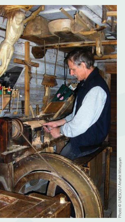
♠ Cross-crafting in Lithuania