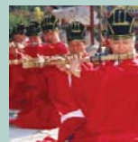
Intangible Cultural Heritage