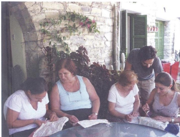
The Studying Lefkaritiko Lace Making Apprenticeship Programme of the Cyprus National Commission for UNESCO.

Finally, in October 2013, the Commission produced and circulated, the first issue of its quarterly electronic newsletter with the aim of enhancing awareness and information in relation to the aims, programmes and activities of UNESCO.