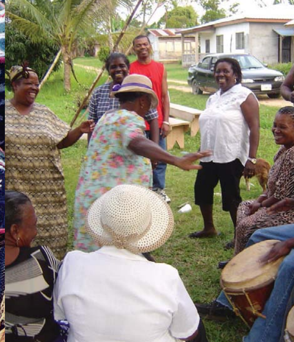
Language, Dance and Music of the Garifuna